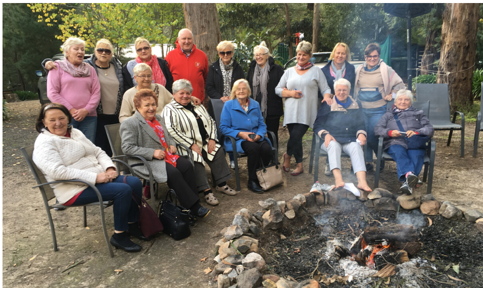
SSG SPORT Rowville at Polana Camp in Healesville