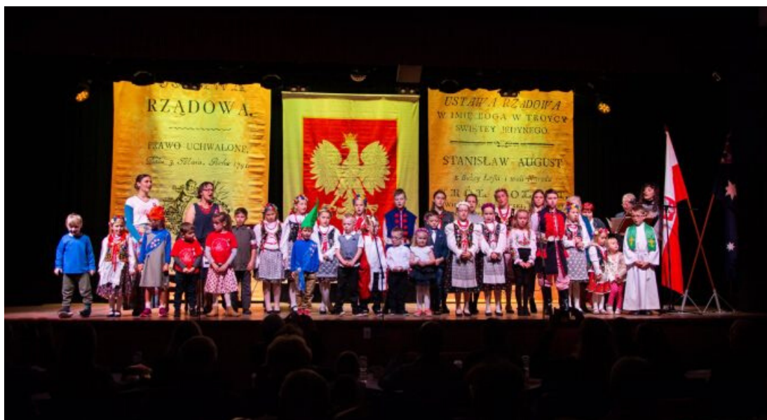
3rd of May concert