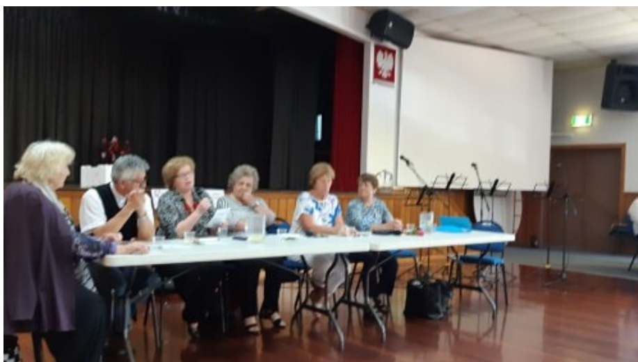
Information session at the Seniors Club in Rowville

"I am very happy for the services and care provided by the Polish Community Council for my mum. It provides a sense of belonging and common heritage interest."