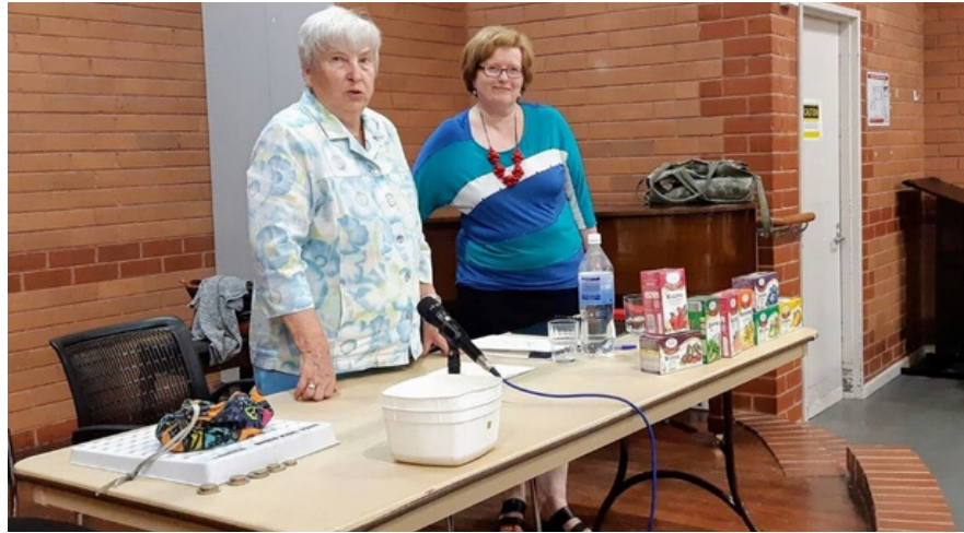
Lecture about the Palliative Care Program in Citizen Seniors' Club 'Astry' in St. Kilda