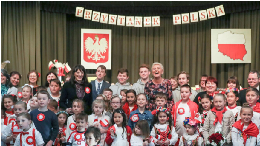
The First Lady, Mrs Agata Korhauser-Duda, with students, teachers and parents from Polish schools