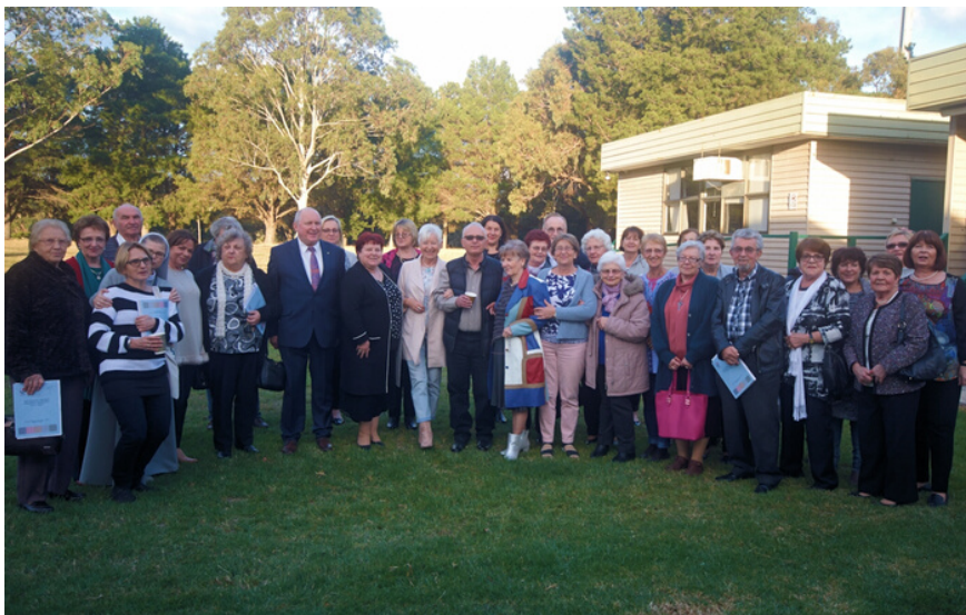
Celebrating Volunteer's Week with volunteers of PCCS and PCCV