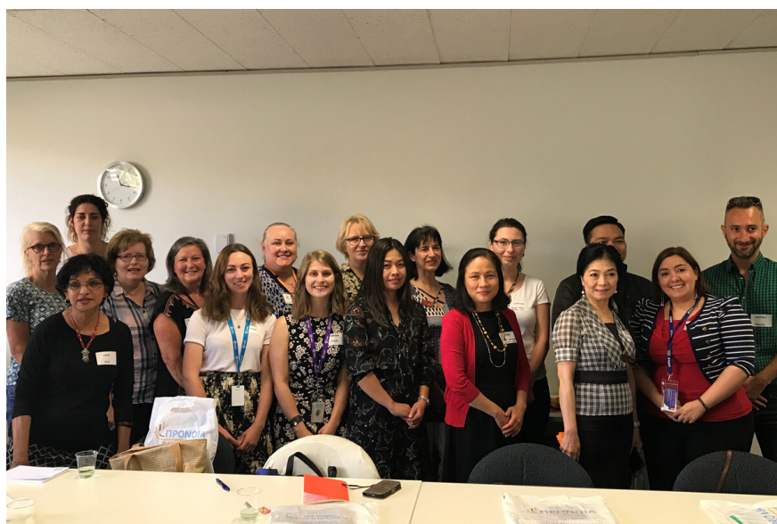
Training provided by Palliative Care Victoria