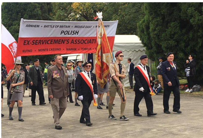
Anzac Day Parade