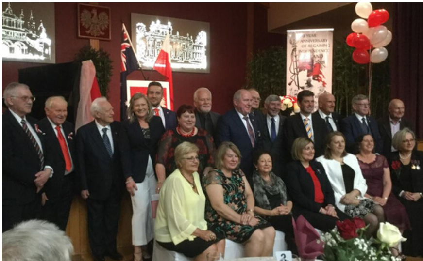
Polish Independence Day Celebration - Gala Dinner in Polish Club in Albion