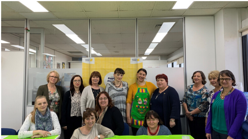
Supporting Cancer Council during Australian's Biggest Morning Tea