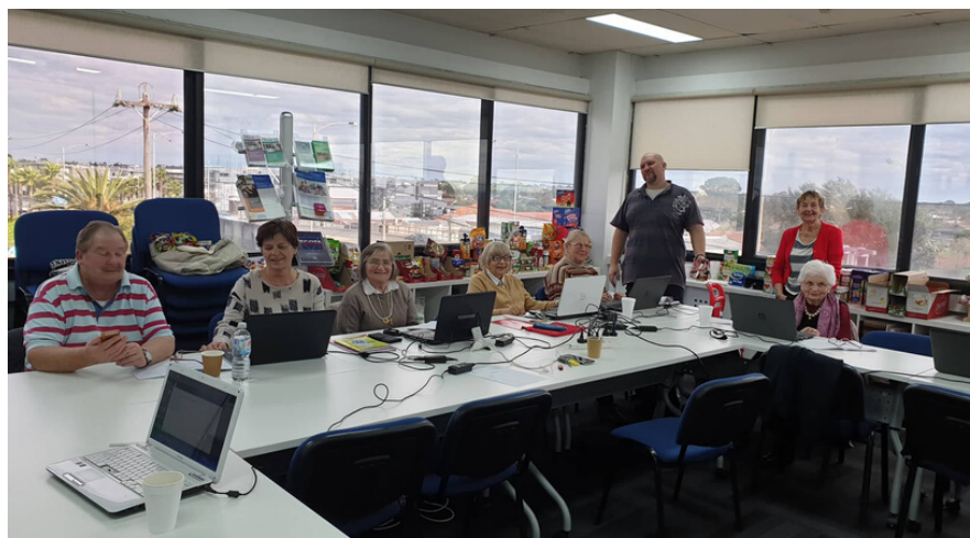
IT Group in Oakleigh