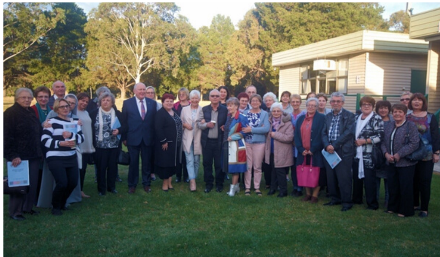
Volunteers of PCCV and PCCS

The Service System Development Program also helps community development and provides assistance to 20 Polish Seniors Clubs. Meetings are organized every two months for presidents of Polish Seniors Clubs, volunteers and carers. They have opportunities to undertake training, and exchange information and experiences. They also spend social time together.