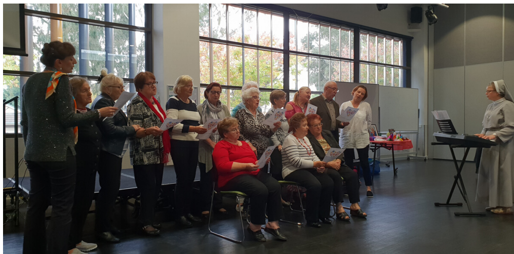
Project 'Love in any language' in partnership with Australian-Filipino Community Services