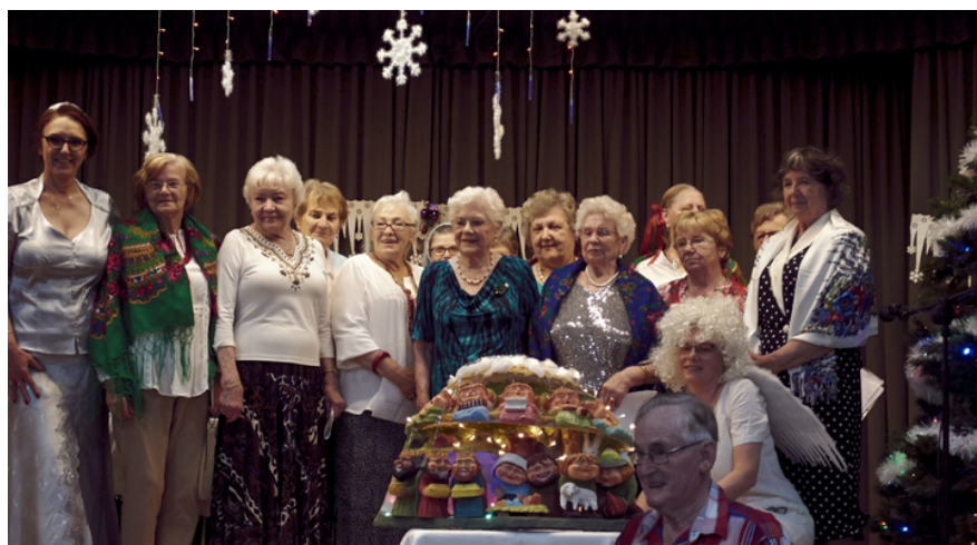
Christmas party for clients