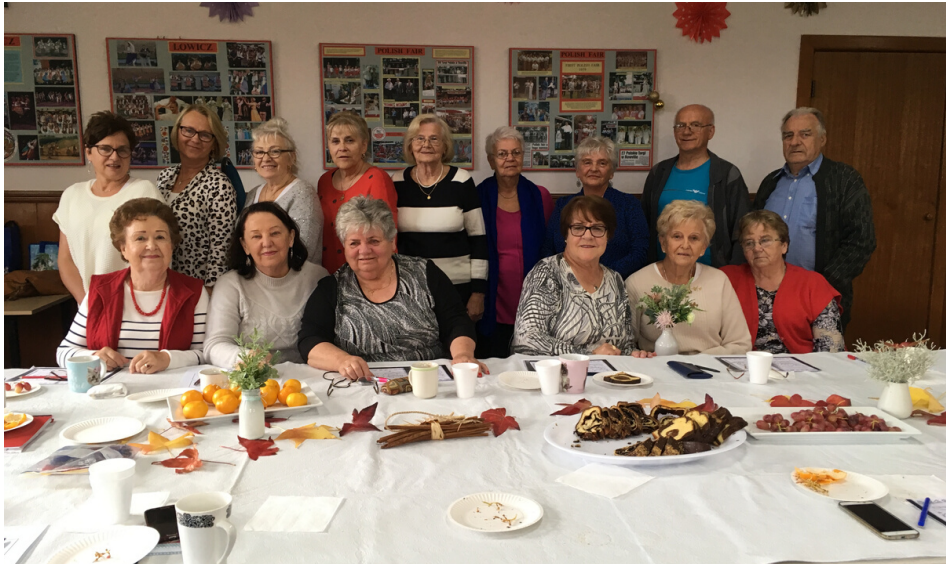
SSG SPORT Rowville

Our program is made up of 10 staff and 8 volunteers.