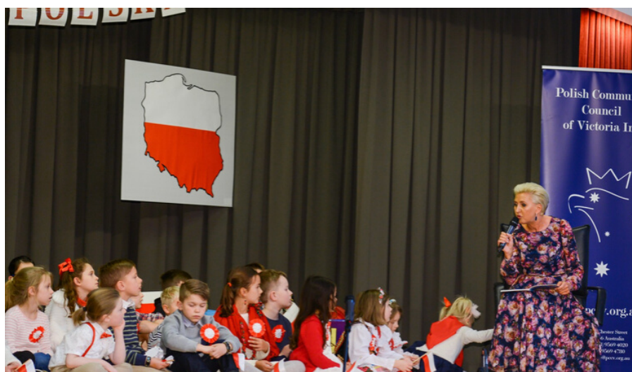
First Lady with students in Polish House SYRENA in Rowville

In August 2018, during the President of Poland's, Andrzej Duda's, first visit, we hosted a meeting with his wife First Lady Agata Korbhanser-Duda. Preparations for this visit were made by Polish Community Council (PCCV) member Polish language schools. School representative teachers, parents and children contributed to this event. Over 150 people were involved, with over 30 teachers and approximately 80 children. School children performed the play 'Przystanek Polska', preceded by a performance of a play about a Polish/Australian 'Wawel Dragon' by the St Albans M. Kopernik school. School performances concluded with the First Lady and children enjoying a celebratory cake and a cup of tea.