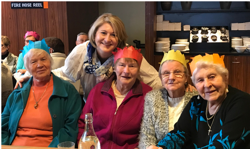
SSG Brunswick celebrating Christmas in July