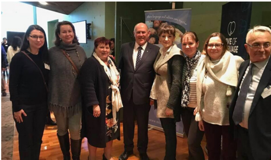
Teachers at the Victorian Ethnic Schools conference

Teacher representatives of the PCCV member schools participated in the annual State Conference of Community Language Schools held at the RMIT Storey Hall. Some also attended the National Conference in Brisbane.