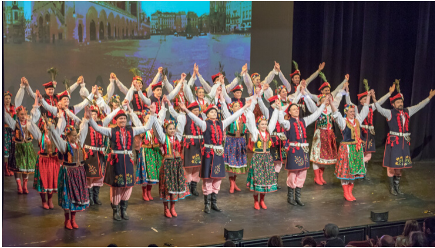
'Tribute to freedom' concert at Drum Theatre in Dandenong