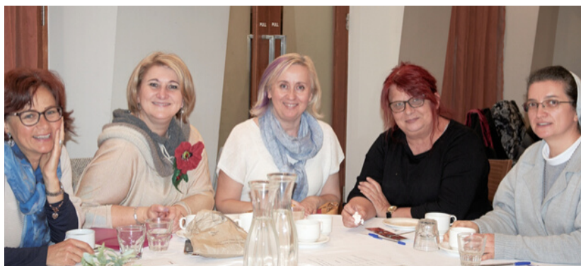
NDIS training for employees and volunteers