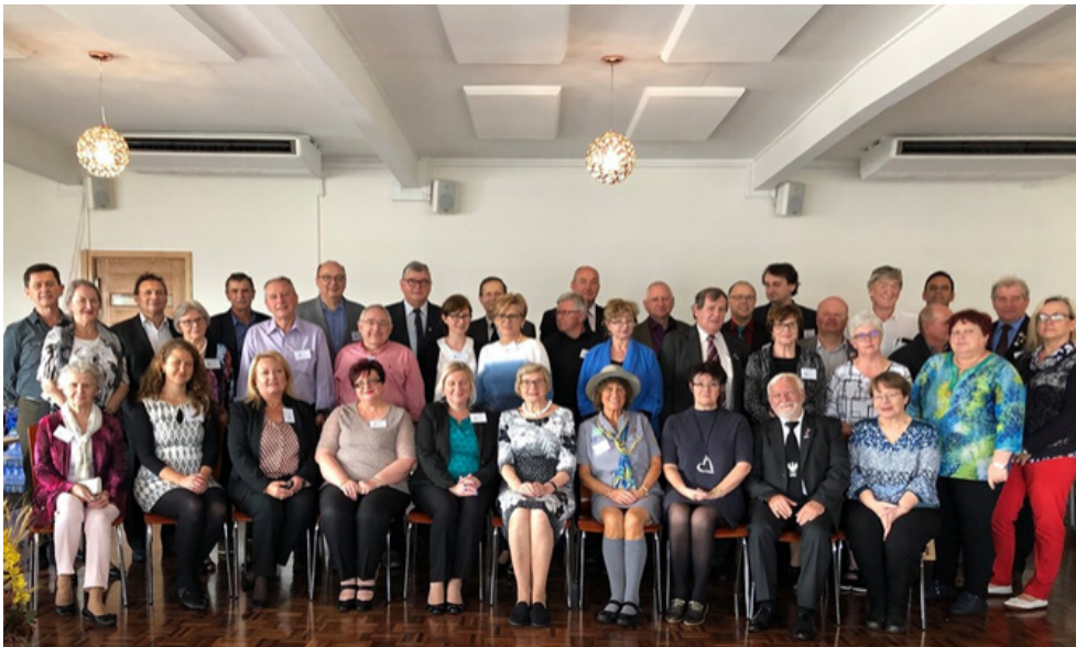
51st Congress of Polish Council of Australia Inc. in Brisbane