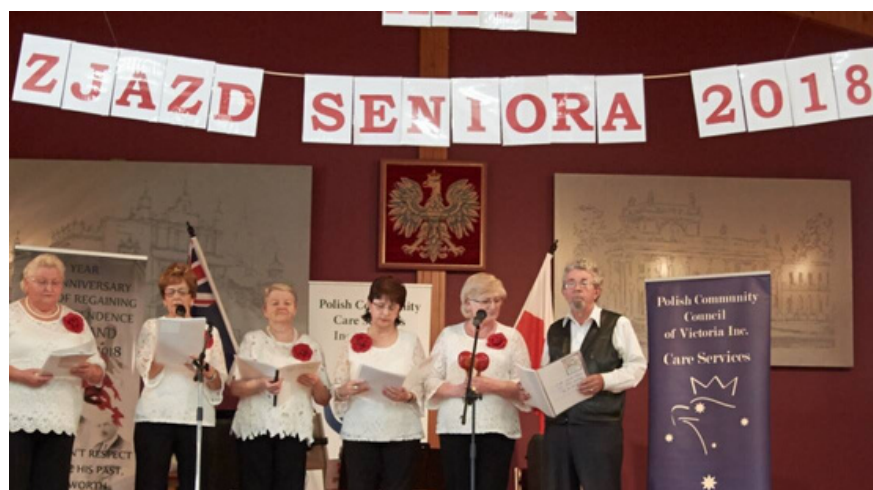
XXIX Polish Seniors' Day in Albion