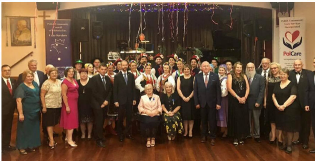
PCCV Charity Gala Ball at Polish House SYRENA in Rowville