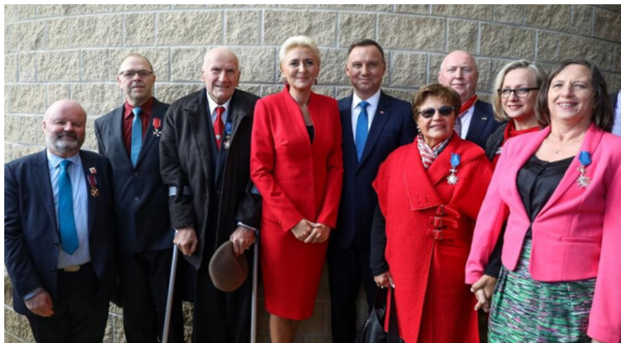
The President and the First Lady during a meeting with the Polish community at the Polish Shrine of Divine Mercy in Keysborough