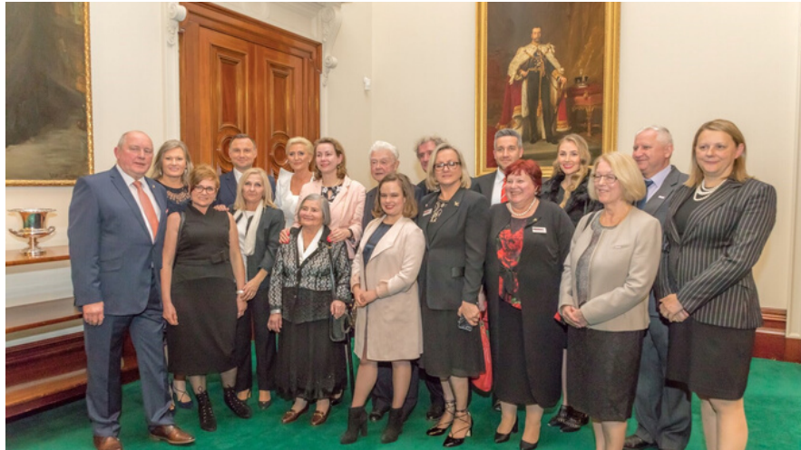
The Polish community during a meeting with the President and the First Lady at Government House during the first official visit of the President of the Republic of Poland in Australia