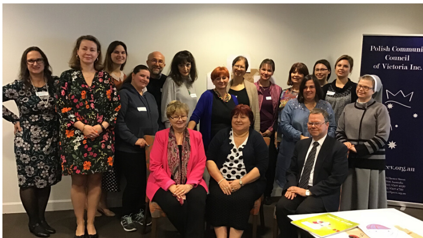
Conference for teachers and professionals at Punthill Hotel in Dandenong