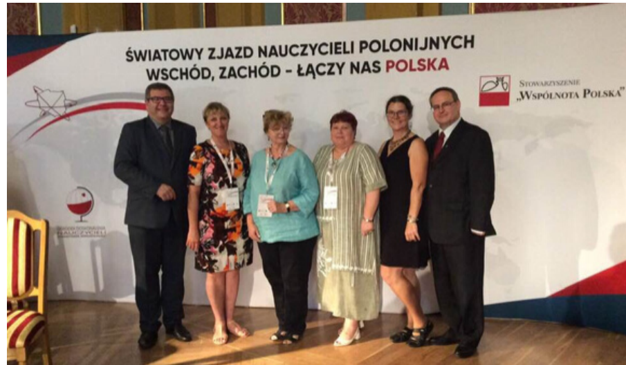
International Conference of Polish Language schools in Torun

In June 2019 the School Coordinator participated in the international Conference of Polish Language schools held in Torun – Poland.