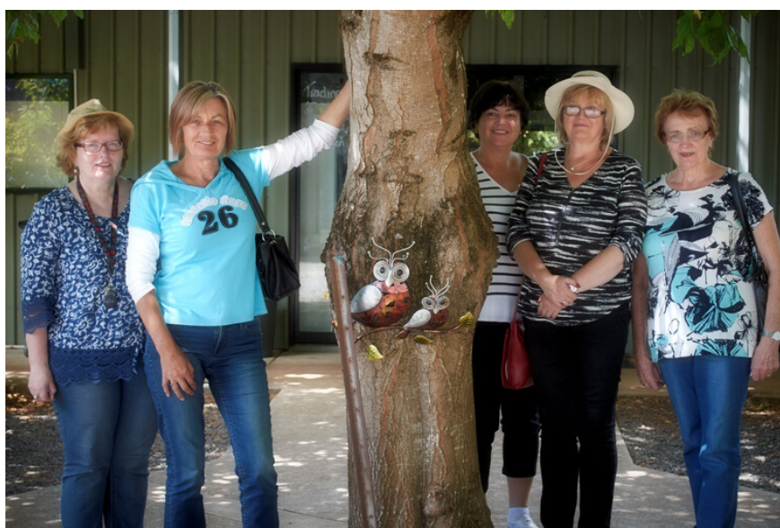
Carers' excursion to Jay Berries farm