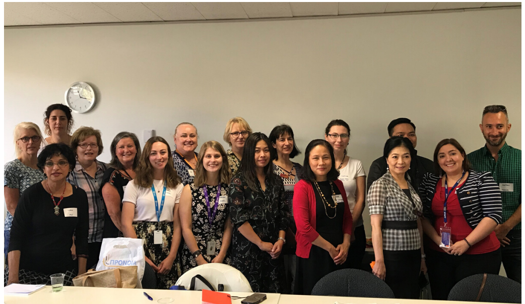
Training with Palliative Care Victoria