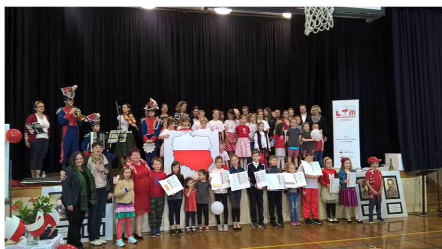
Birthday of 'White and red' Poland by Polish schools' communities