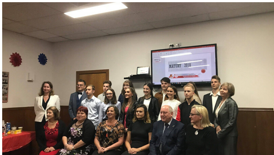
General Consul Scholarship Presentation for participants of Year 12 exam (Matura) in 2018