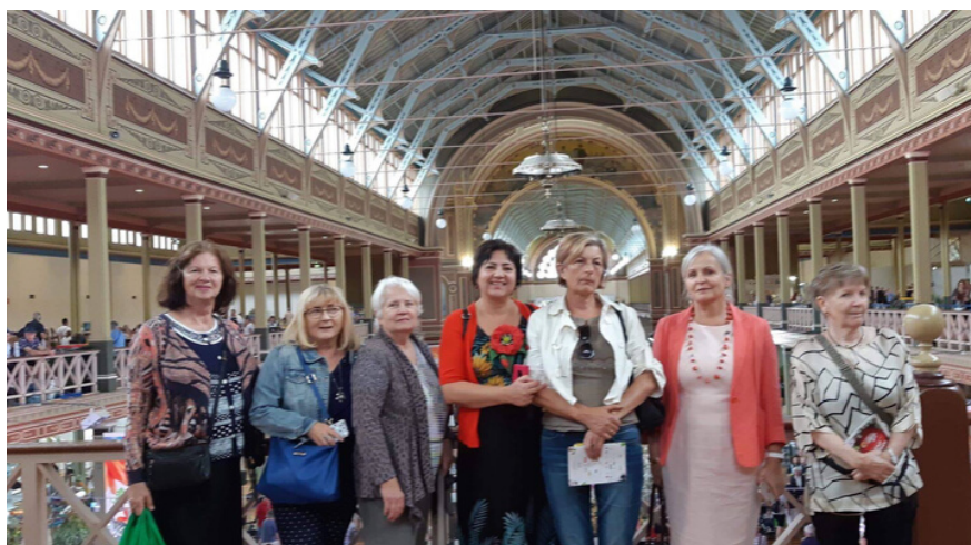
Carers' excursion to Royal Exhibition Building in Melbourne