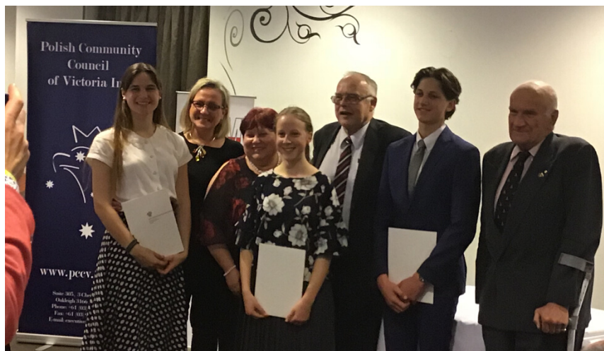
Presentation of scholarships from the PCCV and the Association of Polish Professionals to talented students from the Polish community