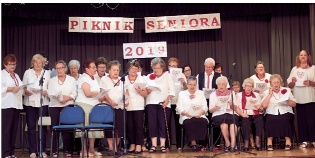
Performance of SSG participants during Seniors' Picnic in Polish House SYRENA in Rowville