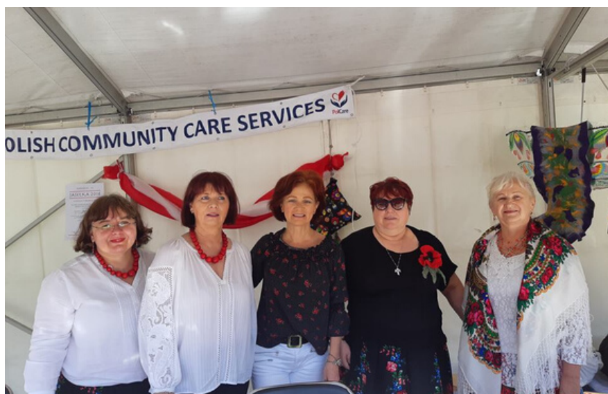
Polish Festival at Federation Square