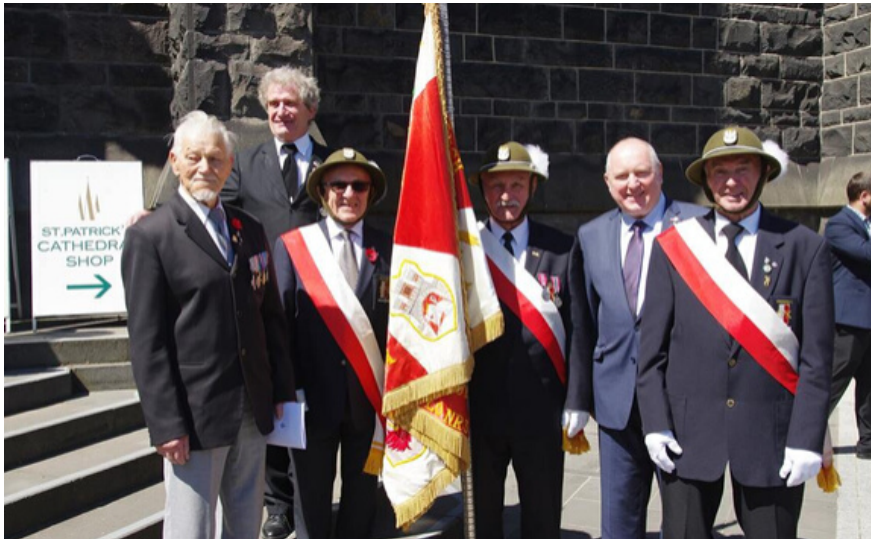
Celebration of Polish Independence Day in front of St. Patrick's Cathedral in Melbourne