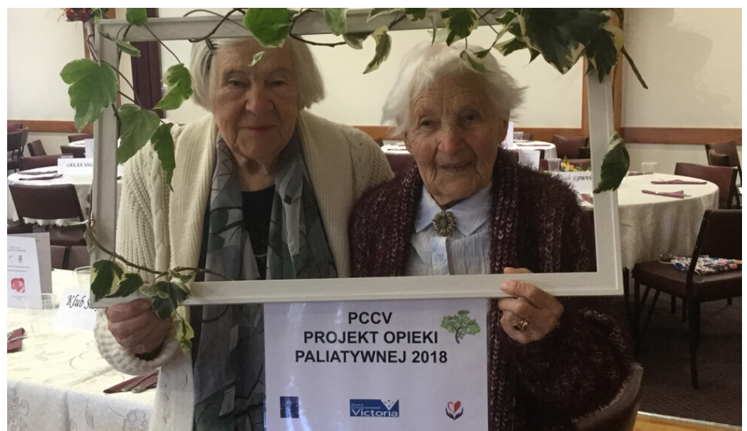
Celebrating the Palliative Care Program