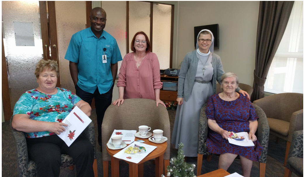
Scottvale Nursing Home (2018)

I would like to thank all volunteers who joined this program last year for their presence and openness to the needs of the elderly and those who need support. For me, working as a coordinator was intense and full of joy, meeting volunteers and Polish seniors. I am glad that a growing group of our compatriots in nursing homes are in contact with volunteers.