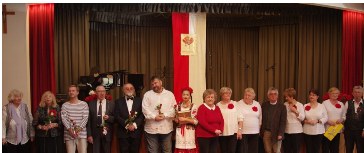
Celebrating the 75th anniversary of The Battle of Monte Cassino