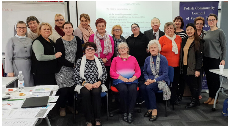
Training for volunteers provided by Swinburne University