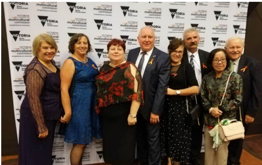
PCCV during The Premier's Gala Dinner at Melbourne Convention & Exhibition Centre