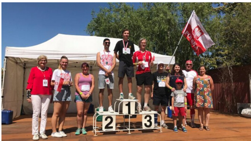
50th Polish Sport Festival at Polish Club in Albion